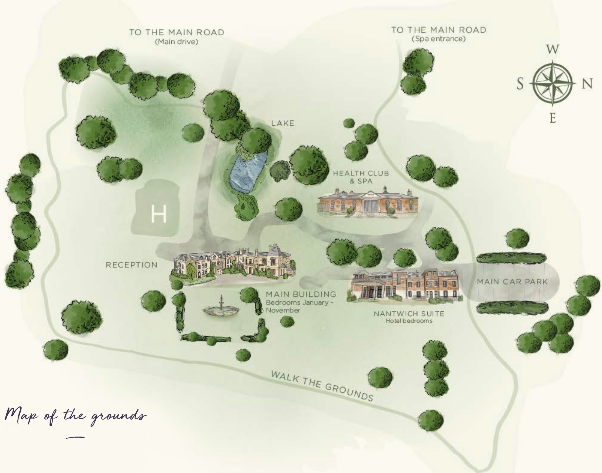
Map of the grounds